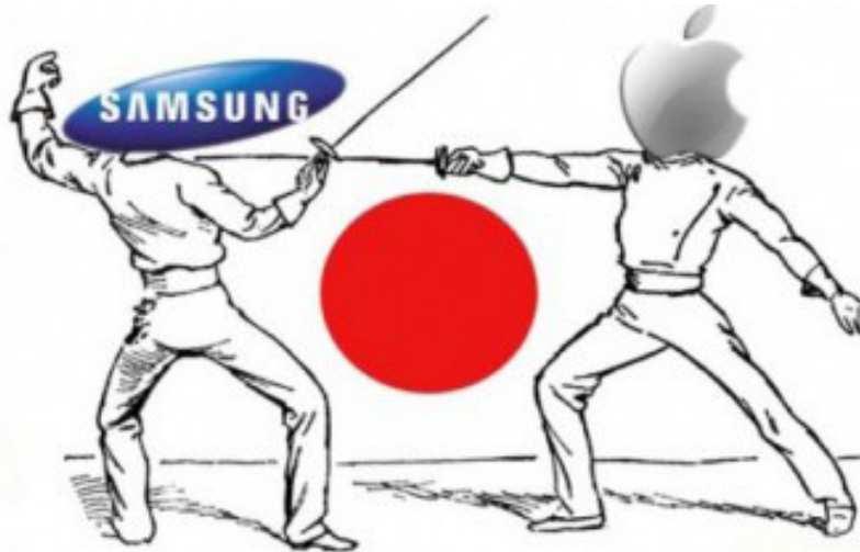
I believe both of their products would fence a good price at a pawn shop. Get it?

After long delegation the United States government has hesitantly decided to ...see Media War on back